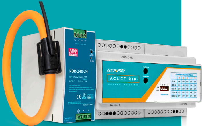
Rogowski Coil and Power supply sold separately

The Accuenergy Relay Class Rogowski Integrator Kit is engineered to be an installer-friendly, plug-and-play solution for use with any protection relay or power meter with a 1A nominal input. Ideal for installations where spacial constraints or conductor size prohibit the use of rigid-body current transformers, flexible Rogowski coils streamline the installation process for exceptionally rapid deployment.